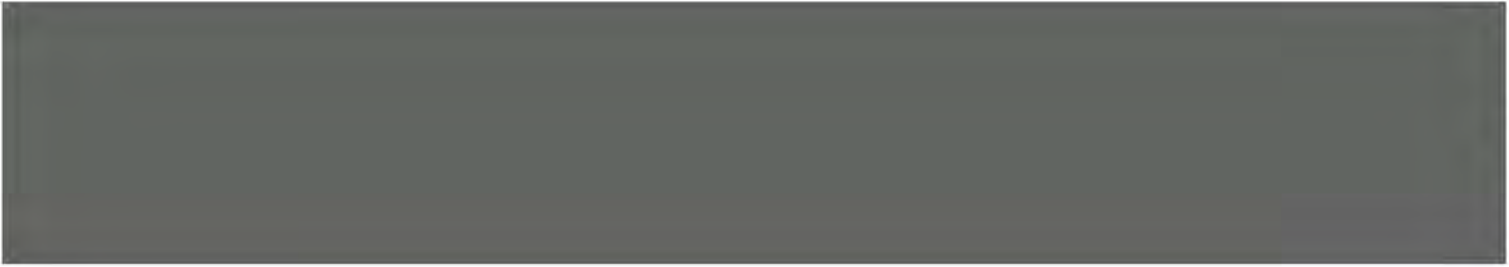
Fascia & Metal Accents SW 7068 Grizzle Gray (236-C6)