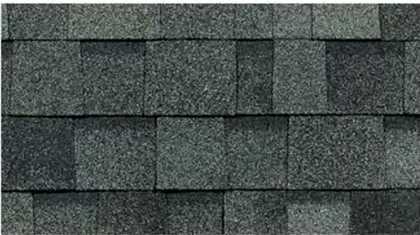
Owens Cornings Roofing Oakridge - Estate Gray