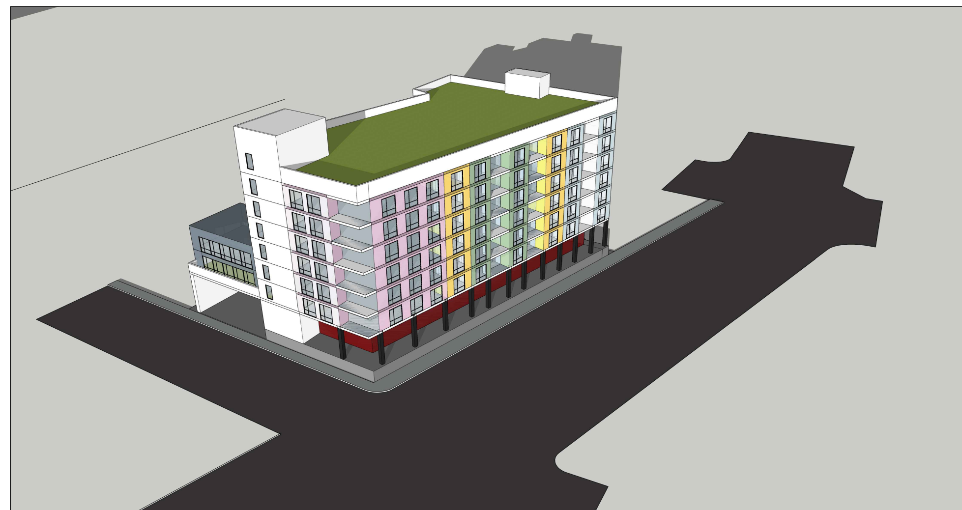
Aerial View from North