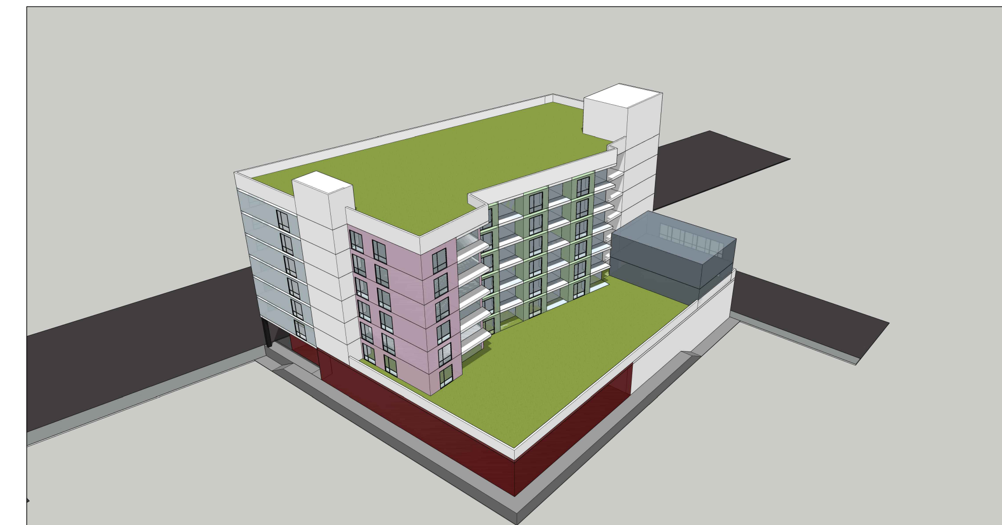
Aerial View from South