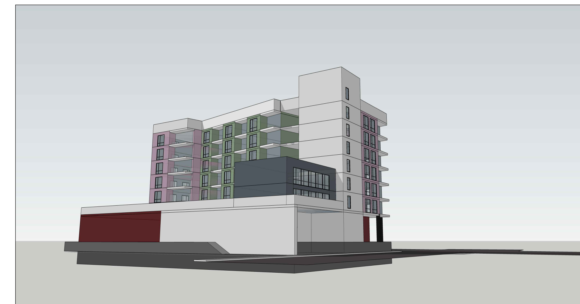
Street View from South-East