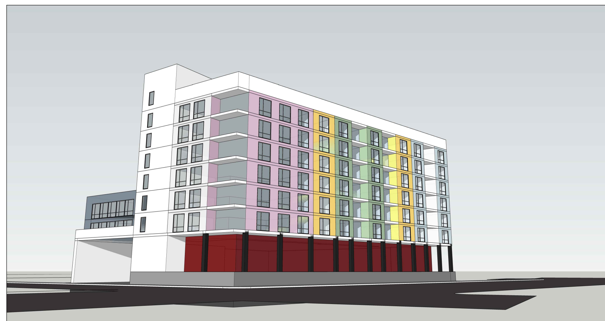
Street View from North