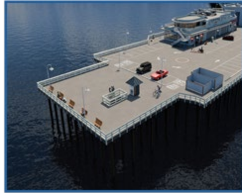
Bents 167-170 End Interim Repair