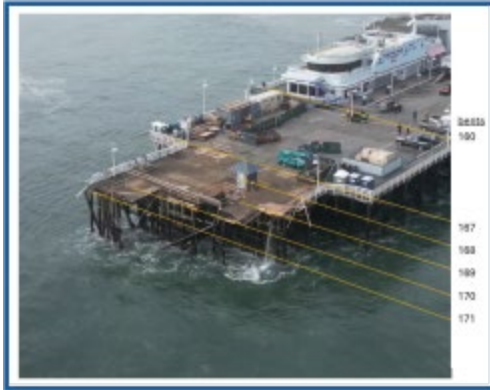
Bents 167-171 Post Collapse