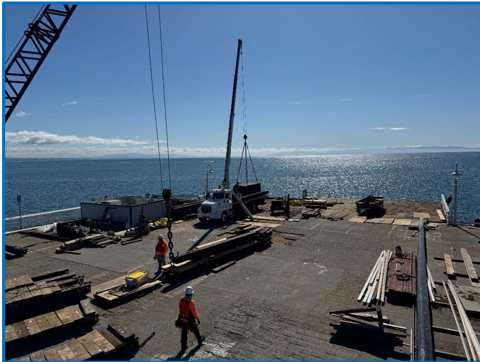
Clearing jobsite in preparation for new decking and asphalt.