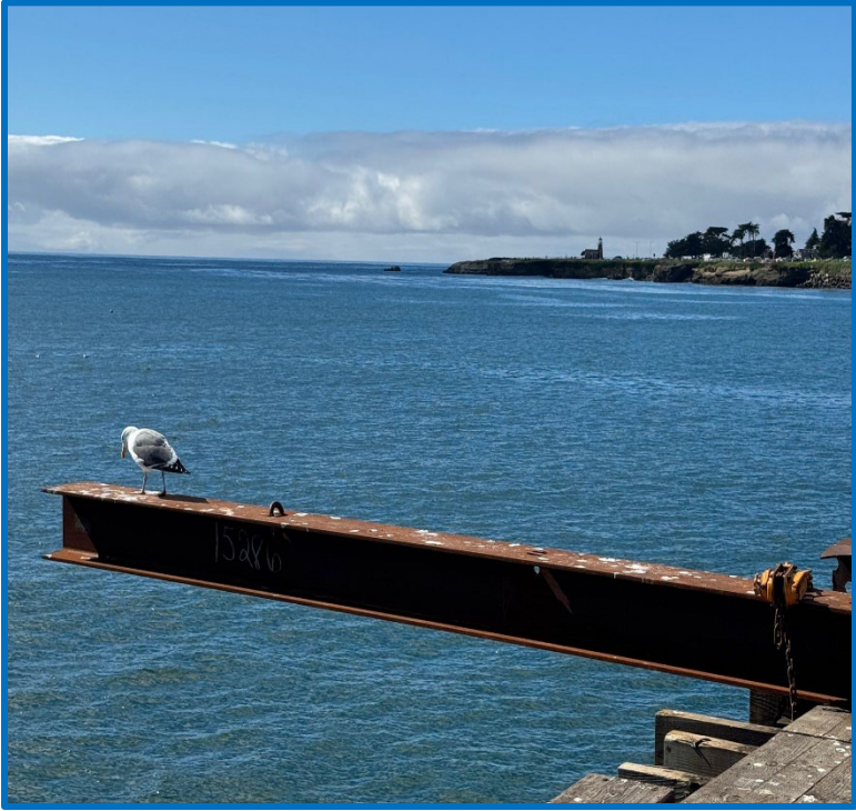
Apprentice project inspector at work.