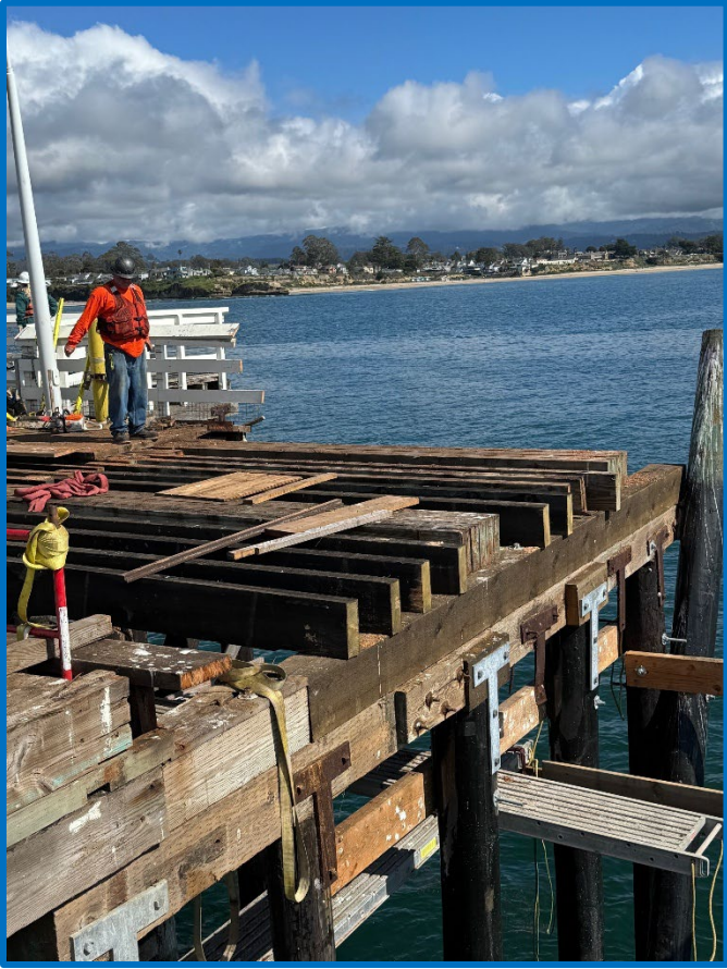
New stringers at Bent 169. These will be extended to the last bent (Bent 170).