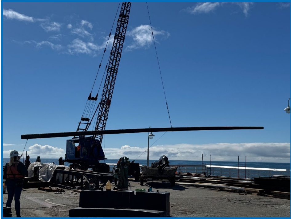
Last pile hoist (30 of 30).