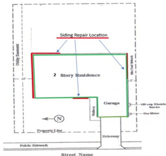
Sample Site Plan